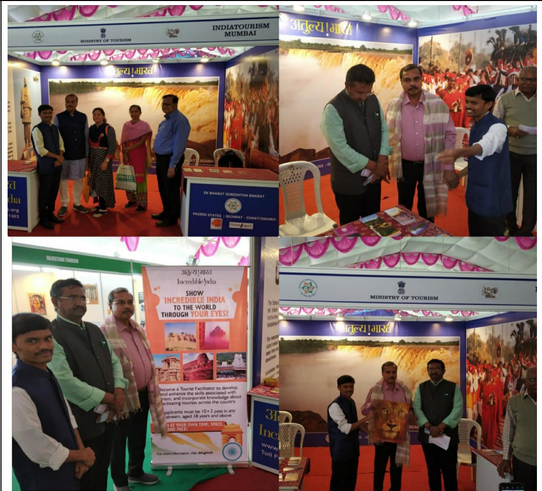
Hon. Member of Parliament, Surendranagar Dr. Mahendrabhai Munjapara visited the Incredible India stall at Destination Gujarat Exhibition December 18-20, 2019