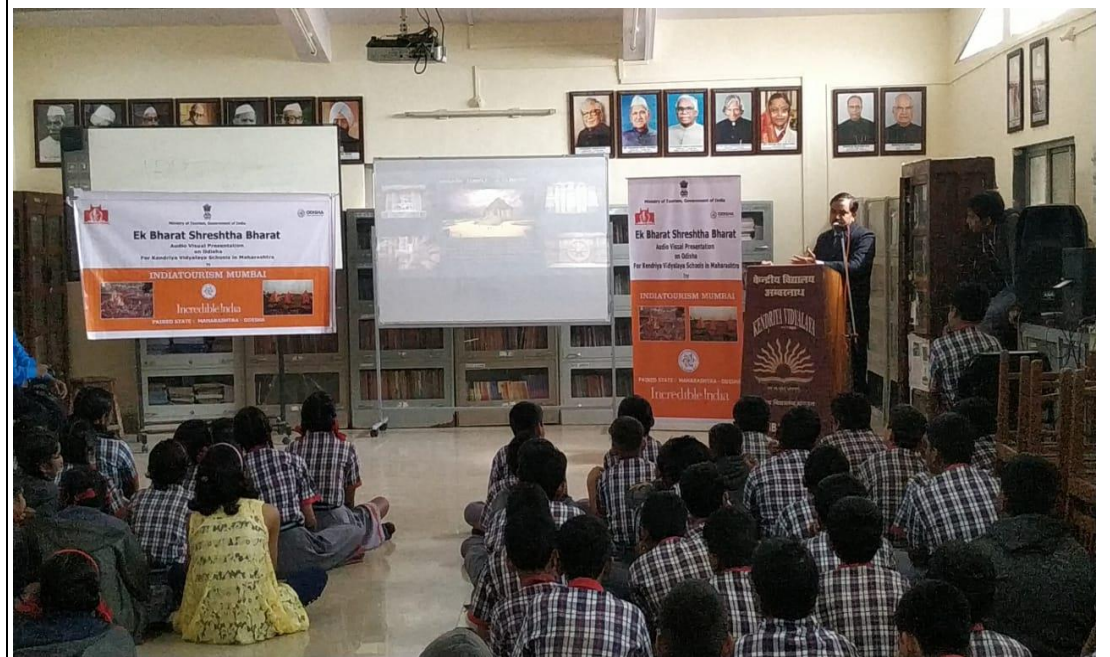
Audio Visual presentation on “Know Odisha” at Kendriya Vidyalaya School, Ambarnath, Thane District on 19 th December, 2019 as Maharashtra & Odisha are paired state under EBSB