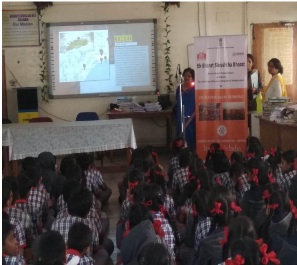
Audio Visual presentation on "Know Odisha" at KV Colaba, Mumbai on 19 th December, 2019