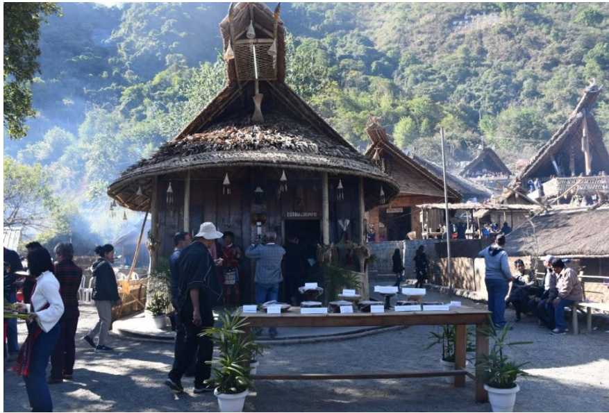
Hornbill Festival Nagaland 2019