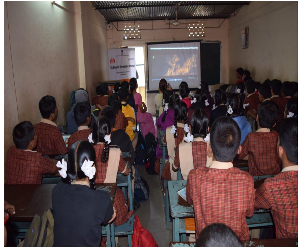
Audio Visual presentation on "Know Odisha" at Jagruti Vidyalaya, Aurangabad on 24 th December 2019 as Maharashtra & Odisha are paired state under EBSB