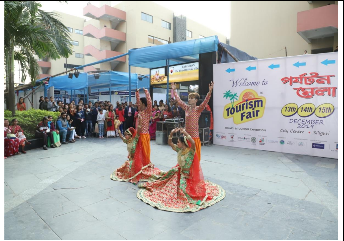
Cultural Performances during Tourism Fair of Blue Eye India under Ek Bharat Srestha Bharat