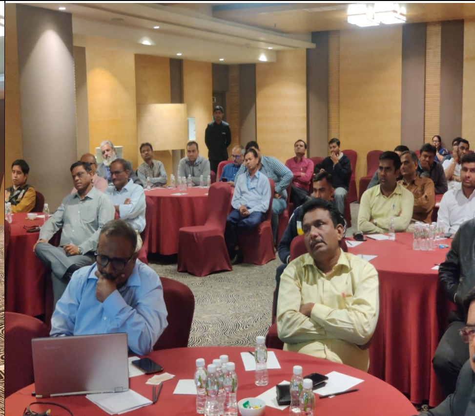
Know Chhattisgarh seminar for the Travel Trade of Gujarat in Ahmedabad on 30.12.2109 under the Ek Bharat Shreshtha Bharat (EBSB)