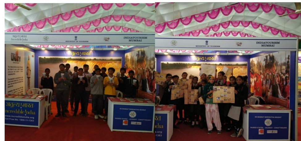
Showcased the Tourism Potential of Chhattisgarh at Destination Gujarat Exhibition as Gujarat & Chhattisgarh are paired state under EBSB