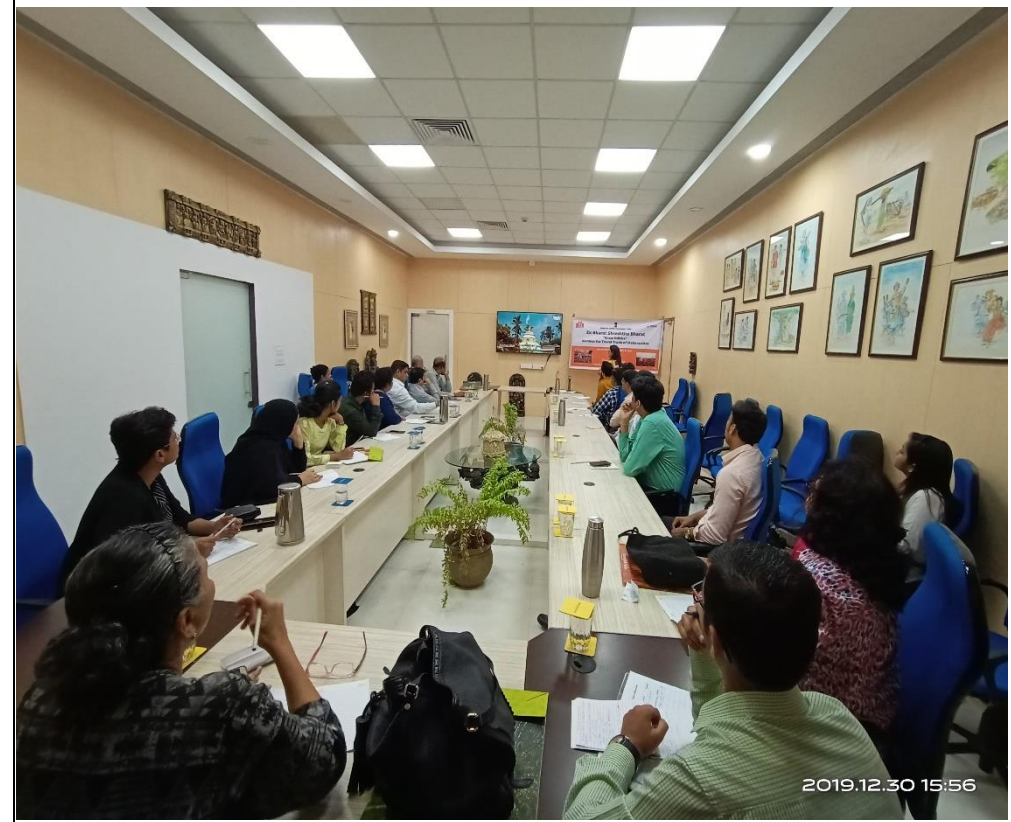
Know Odisha seminar for the Travel Trade of Maharashtra in Mumbai on 30.12.2109 under the Ek Bharat Shreshtha Bharat (EBSB)