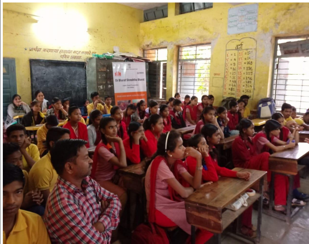
Audio Visual presentation on "Know Odisha" at Mahanagar palika School, Aurangabad on 26 th December 2019 as Maharashtra & Odisha are paired state under EBSB