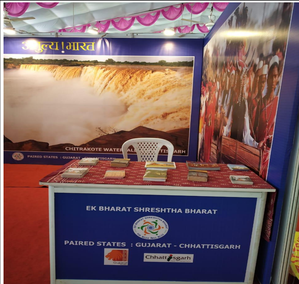
Branding of EBSB at Destination Gujarat Exhibition, Surendranagar December 18-20,2019