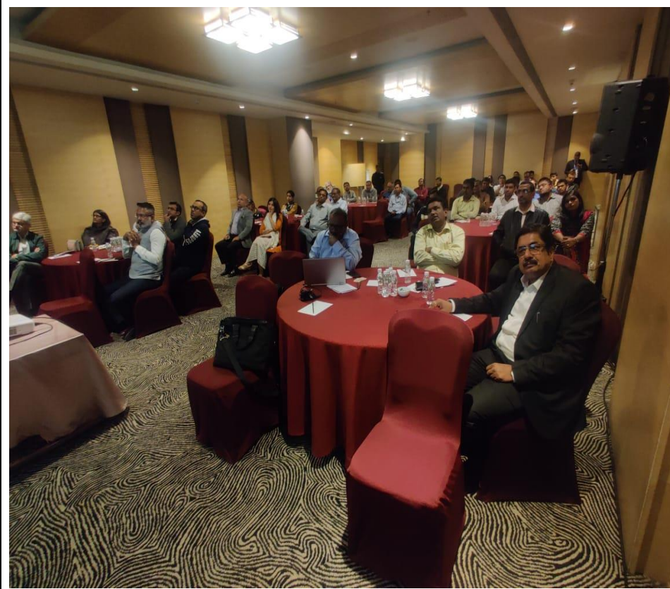
Know Chhattisgarh seminar for the Travel Trade of Gujarat in Ahmedabad on 30.12.2109 under the Ek Bharat Shreshtha Bharat (EBSB)