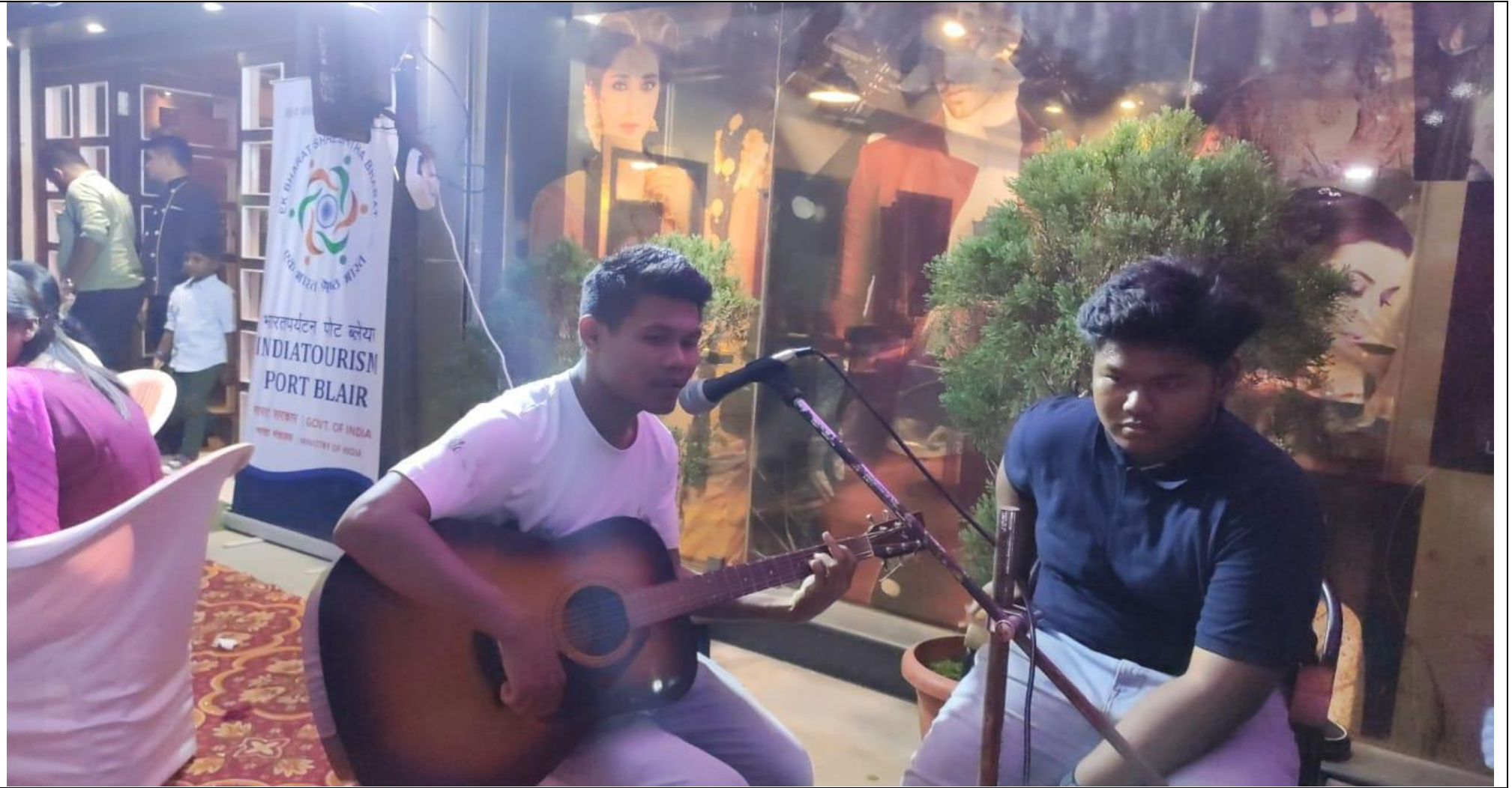
Cuisine and Music Festival on Andaman & Nicobar and Lakshwadeep Pair under EBSB