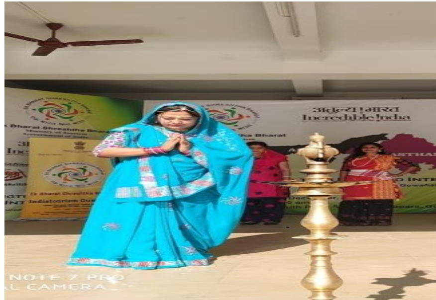
EBSBP at South Point school, Guwahati December 2019