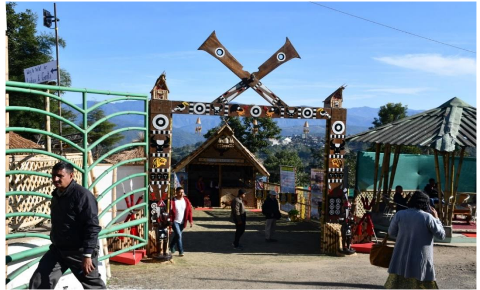
India Tourism Stall at Hornbill Festival Nagaland 2019