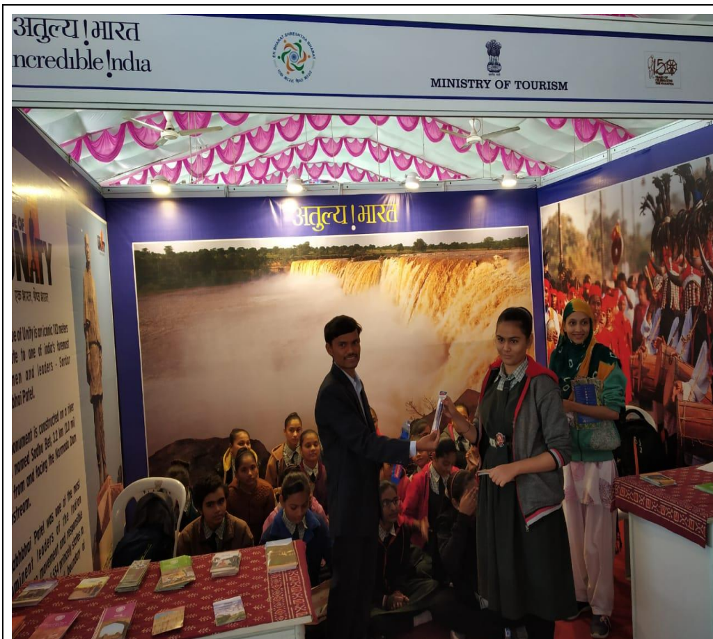
On the spot Quiz Competition organised for school children of Gujarat on Tourist places in Chhattisgarh at Destination Gujarat Exhibition