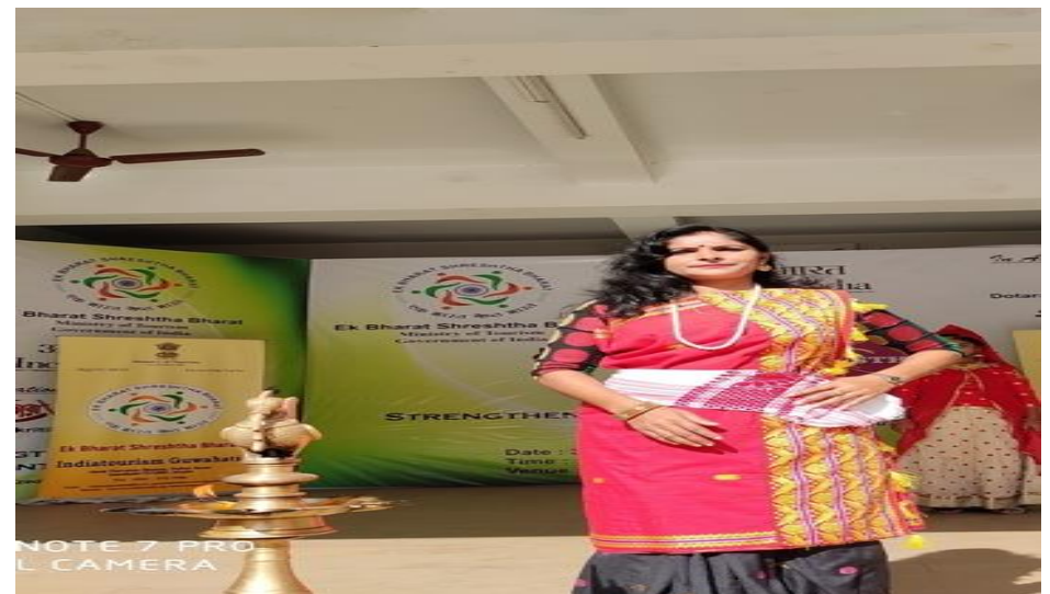
EBSBP at South Point school, Guwahati December 2019